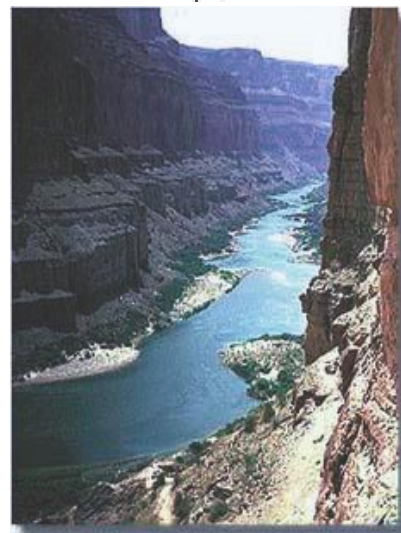
The Grand Canyon!

Would I do it all over again? My name goes back on the permit waiting list next year, and there isn't anyone from the Grand Canyon Yahoo II Expedition that I wouldn't invite again!