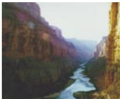
Downstream view of Nankoweap Canyon